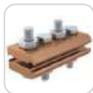
Contact Wire Splice Fitting