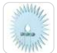
Anti Bird Disc