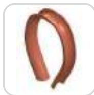
Thimble (Dropper Wire)