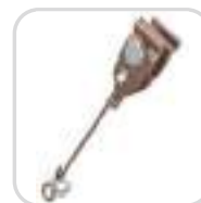
Dropper fittings for PTFE Short Neutral Section