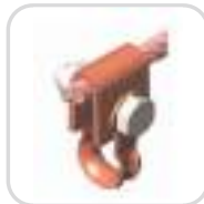
Catenary Wire Clamp Assembly