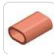
Sleeve (Dropper Wire)