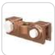
Contact Wire Clamp