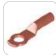
Lug (Dropper Wire)