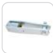
Forked Collar Socket