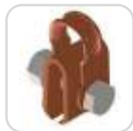
Contact Wire Clamp Assembly